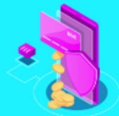
Send and Receive Crypto