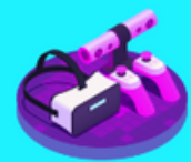
Crypto Integrated Games