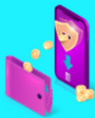
Crypto and Cash Wallet